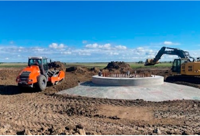
Once the foundations are poured and the concrete is set, they're backfilled leaving just a small portion of the pedestal where the tower will be secured above the surface.

Construction continues for the 28 approved wind turbines. All the turbine foundation pours are expected to be complete by mid-July (weather pending). Access Land Services is sharing the daily haul route notices by email for concrete pours. To be added to the distribution, please contact us at the information listed on page 2.