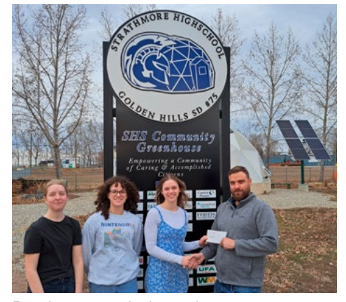
Proud to support the innovative programs at Strathmore High School