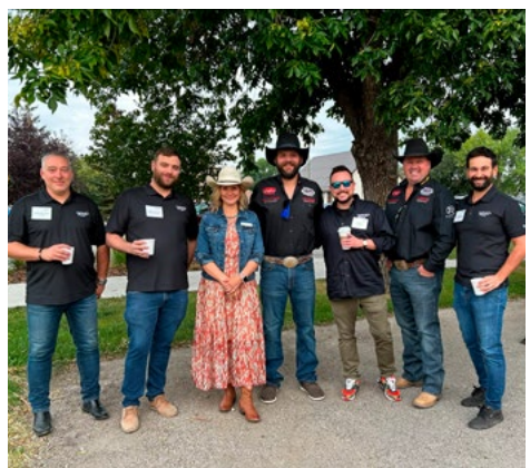
Always a great time at our pancake breakfast Come see us at the Legion on Aug 2.