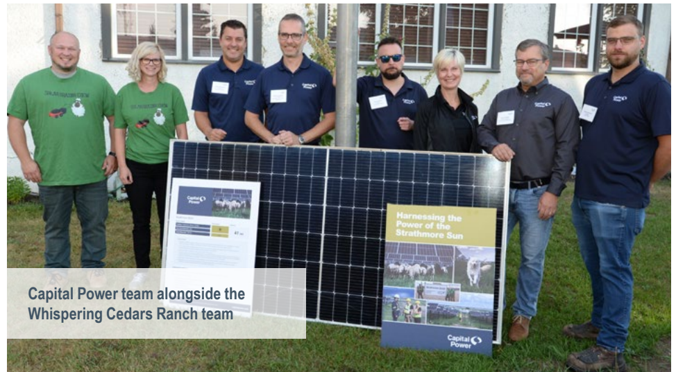
Capital Power team alongside the Whispering Cedars Ranch team

Capital Power hosts 800 sheep from Whispering Cedars Ranch to graze at our Strathmore Solar facility. These grazing groundskeepers help us to sustainably manage the land on site to reduce fire hazards and help keep the facility well-maintained. This mutually beneficial opportunity maximizes the utility of the solar site by offering local farmers additional land for their animals to graze, grow and thrive.