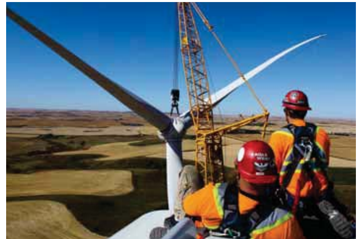
Skilled operators delicately position equipment into place.

Technicians will ensure everything is in working order before the turbine is commissioned and sending electricity to the Alberta grid.