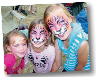
In addition to the great music, there were lots of smiling, painted faces walking around at Grizfest.

Drawing record crowds of 3,500 to 4,000 people each day, Grizfest 2010 brought together young and old to enjoy a weekend of great music. Capital Power was pleased to sponsor the face painting tent and congratulates the organizing committee on a highly successful festival.