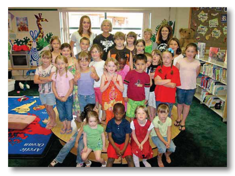
Students gather for an August 6 story time at the Tumbler Ridge Library.

"Reading Rocks!" is part of the BC Summer Reading Club (SRC) in the Tumbler Ridge Library. During the seven week program, 1,243 participants and club members read a total of 3,148 books.