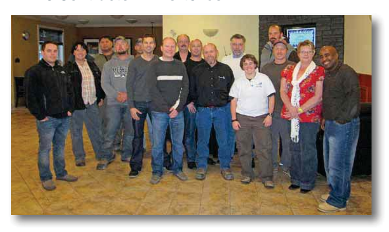
Members from CPC, Mortenson and contractors gather for an initial Environment, Health and Safety meeting.

CPC has selected an experienced Prime Contractor -Mortenson – to provide the engineering, procurement and construction services for the QWP. Mortenson was selected based on its previous experience working in mountainous and extreme weather conditions and current experience on another wind project in close proximity to the QWP.